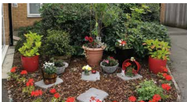
St Herbert's Court

Adaptations have been made to 44 properties, allowing people to stay in their homes for longer. We've also undertaken significant works to 46 bungalows whilst they were vacant, improving accessibility for new residents moving in – ranging from widened doors to altered bathroom layouts and in some cases removing walls and installing lowered kitchens.