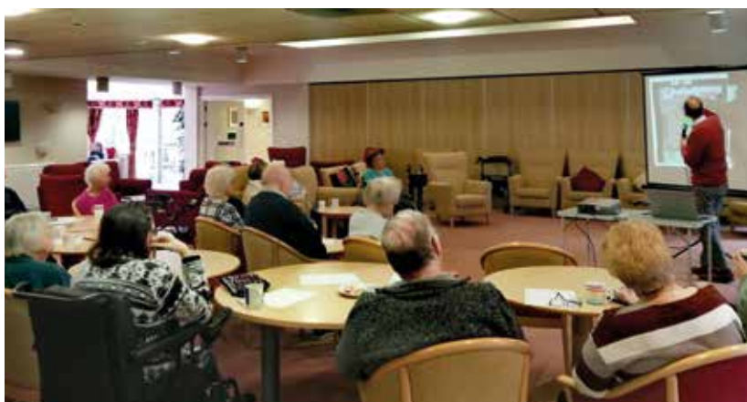
Garden consultation events with residents at Trinity House and Tandle View Court