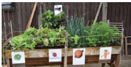
Great Green Garden competition

We also had lots of entries for our 'Great Green Garden Competition', with six of our schemes earning the fantastic RHS North West Britain in Bloom 'It's Your Neighbourhood' award this year. Notably Throstle Court and Cloughgate House received Level 5 Outstanding awards.