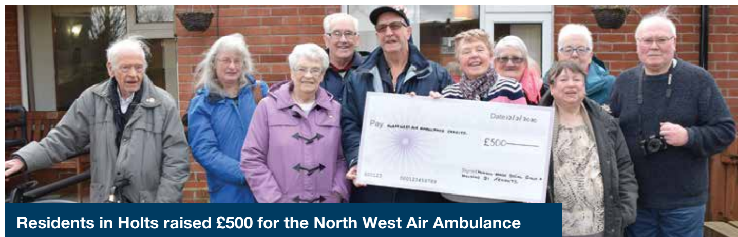
Residents in Holts raised £500 for the North West Air Ambulance