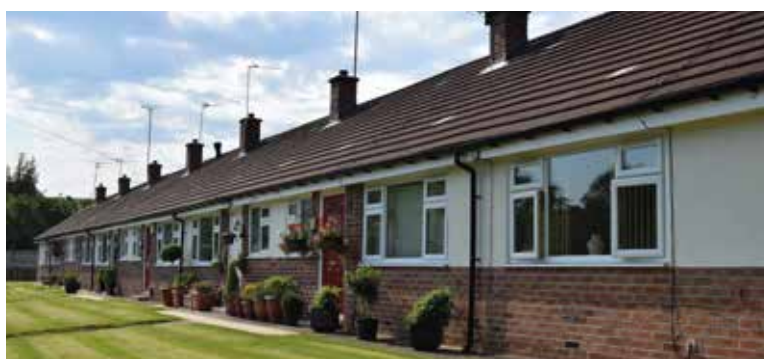
Bungalows in Shaw