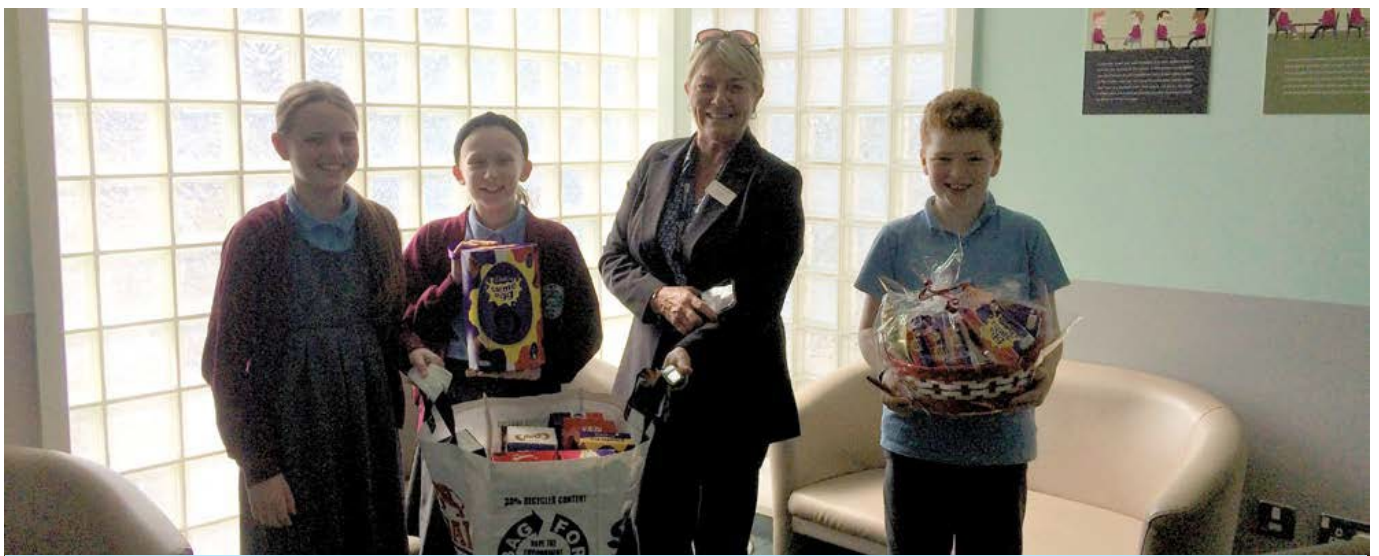
Beechers Court – Partnership with Davenhill School

Intergenerational interaction plays an important part in improving our residents' wellbeing and they love having the local community connection.