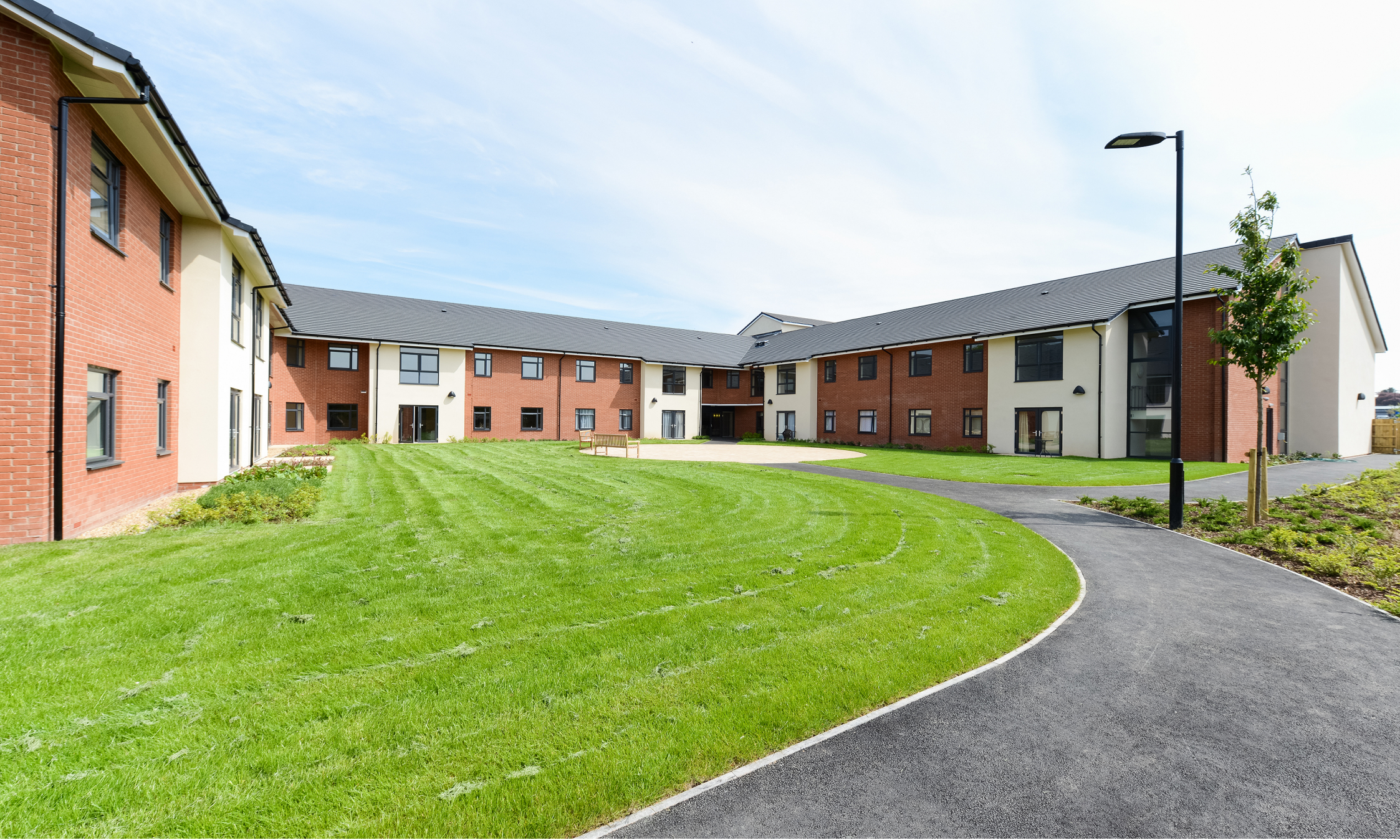
Housing 21 Oakwood Gardens & Mayfield Bungalows Oakwood Gardens, Margaret Avenue, , BEDWORTH , CV12 8FB